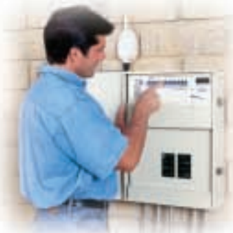
Easy service access: Your service technician can run all programs from the outside equipment pad.