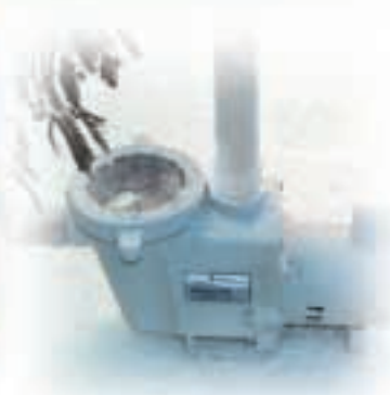
Freeze protection: Built-in Freeze-Guard automatically runs your pumps when temperatures plunge. (In climates where pools are winterized, this feature can be switched off.)