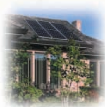
Solar heating option: Add intelligent solar heating control; with IntelliTouch, your existing filter pump is usually all that's needed to pump water through your solar heating system.