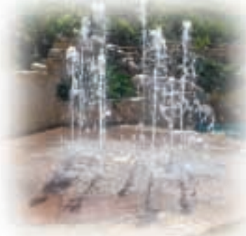
Water features: You can add additional valves and actuators to make fountains and waterfalls, all controlled from your IntelliTouch panel.