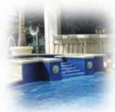
Spa spillway: Create a two-stage waterfall from your elevated spa, with no additional pumps or plumbing.