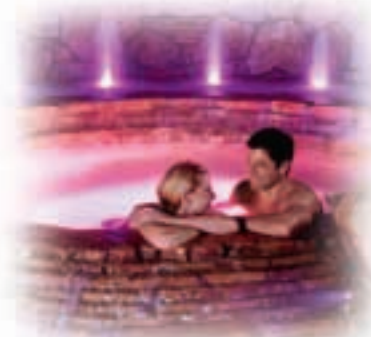
Fountains: Control fountains and lighting with IntelliTouch auxiliary circuits. Your builder can help choose the system that meets your needs.