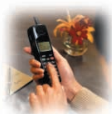
Telephone remote control: Preheat your spa from any touch-tone phone.