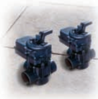
Motorized valves: IntelliTouch systems designed for pool/spa combinations include two valve actuators for convenient pool/spa switching.